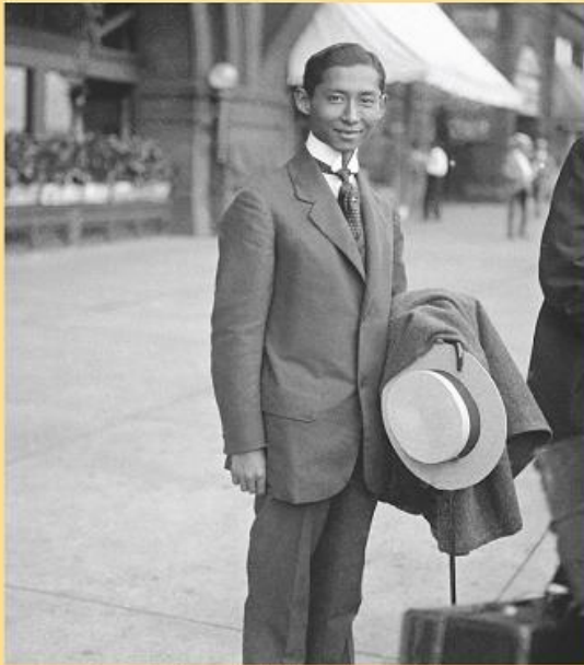
Prince Mahidol of Songkla on his way to Gloucester, MA, August 26, 1916

In honor of His Majesty King Bhumibol Adulyadej & Prince Mahidol of Songkla